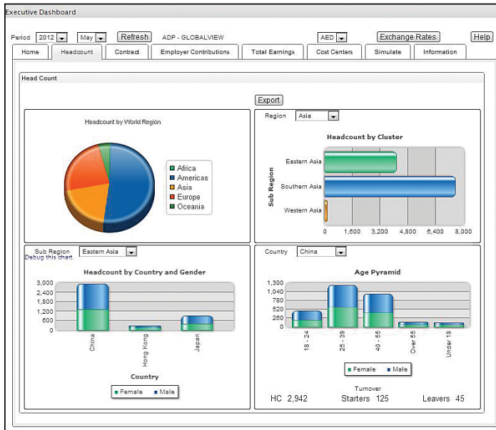
Global, regional and country level data at your fingertips.

Executive dashboards with adjustable filters to give you instant access to your data and answer your questions quickly.