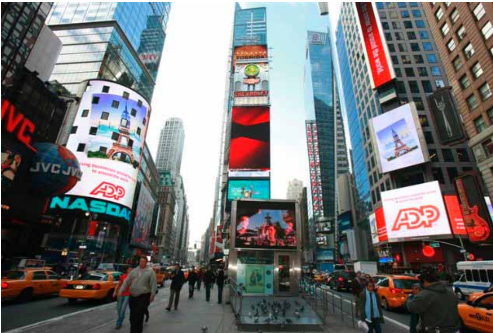
The view from New York's Times Square in December, 2008, when ADP debuted on the NASDAQ.

Experts in automating corporate business processes